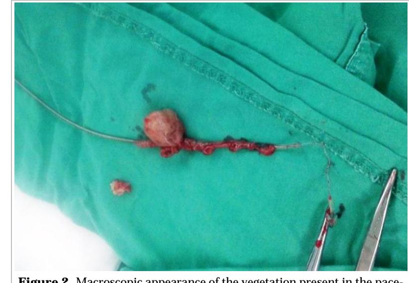
Figure 2. Macroscopic appearance of the vegetation present in the pacemaker removed.

them, 100%, presented fever, general symptoms and arthralgias; and 70%, respiratory symptoms. A 53.3% were admitted with a time of evolution of symptoms less than three months. There was a history of changes in the generator (53.3%), the system (46.7%) and pocket sepsis (30%). In 70%, the staphylococcus sp. was isolated. The vegetations attached to the electrode (96.7%), greater than or equal to 1 cm (80%), and multiple (63.3%), were the most common