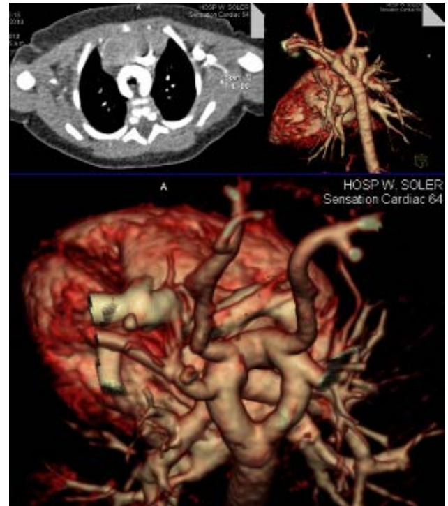
Figure 2. CT angiography study of patients with different types of slices, where both aortic arches are showed.

transducer, the presence of two arcs of similar caliber could be visualized. They originated from the last portion of the ascending aorta and both had posterior direction and passed through their respective bronchi, ending in the descending aorta ( Figure 1 ). The presence of single ductus was demonstrated (left).