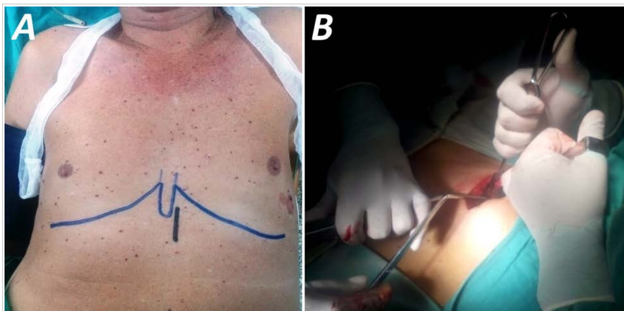
Fig. 1. A. Preoperative sketch for the site of the small incision in a left paraxiphoid line. Subsequent traction and elevation of the wound edges will allow the dissection to be extended to the last costosternal angle without requiring the skin incision to be widened. B. The combined use of aspiration and mobilization of pre-pericardial fat, while being extracted with Allis forceps, has become an effective strategy in patients. This maneuver can be concluded by firmly clamping the pericardium, if not too tensed.

The placement of counter-opening drainage and