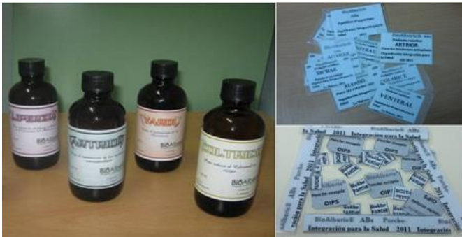
Figure 4. BioAlberic products in water and paper vehicles.

Products can be presented in different formats; so far the most used are water and paper (Figure 4). Those in water support can be used orally and those on paper, protected by plastic, can be applied in two ways: 1) the so-called card that the patient should keep close to any part of the body to achieve the desired effect, and 2) therapeutic patches for the treatment of pain and inflammatory processes that can be located anywhere in the body, they must be attached directly to the affected site with the aid of an adhesive. These forms do not contain any chemical medicine in its physical form.