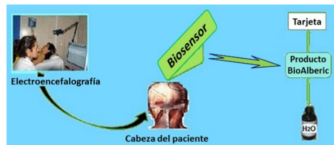
Figura 2. Treatment using electroencephalogram.