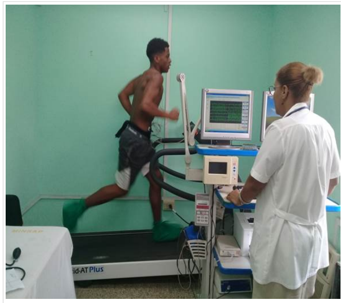
Figure 1. High performance athlete during an exercise stress test.

Researchers from the Mayo Clinic in Rochester<sup>36</sup>, in a study published in 2018, including 12,043 noncardiovascular patients referred for exercise stress test, found –after a mean clinical follow-up of 14 years– that 1,222 (10.1%) of them developed AF. They also pointed out that in those who presented the arrhythmia and had a basal aerobic functional capacity of less than 75%, the risk of dying or having a stroke was significantly higher compared to those who had 105% or more. They concluded then, that an improved cardiorespiratory condition is associated with a lower risk of AF, stroke, or death. They